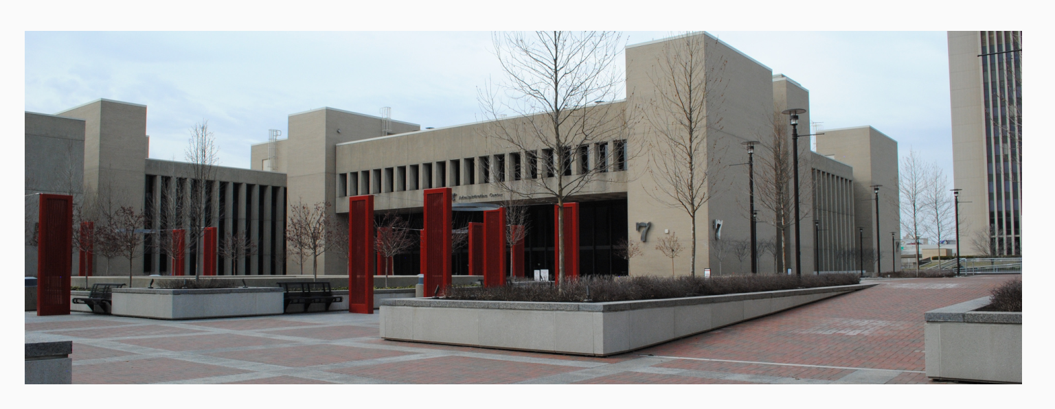
\textbf{The outside of building 7}. \ \textit{Photo Provided by: Rebekah Davidson}

Through strategic leadership and a focus on community relationships, Coss aims to make Sinclair a model of safety and inclusivity; creating a campus where everyone feels valued.