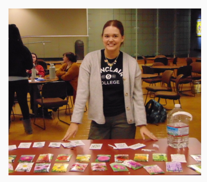
The gardening club.