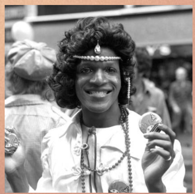
Marsha at 1975 Pride.

From the very beginning of their history in America as slaves through to the civil rights movement, African Americans have had to fight for their rights as human beings. However, this struggle has created some of the strongest human beings in history.