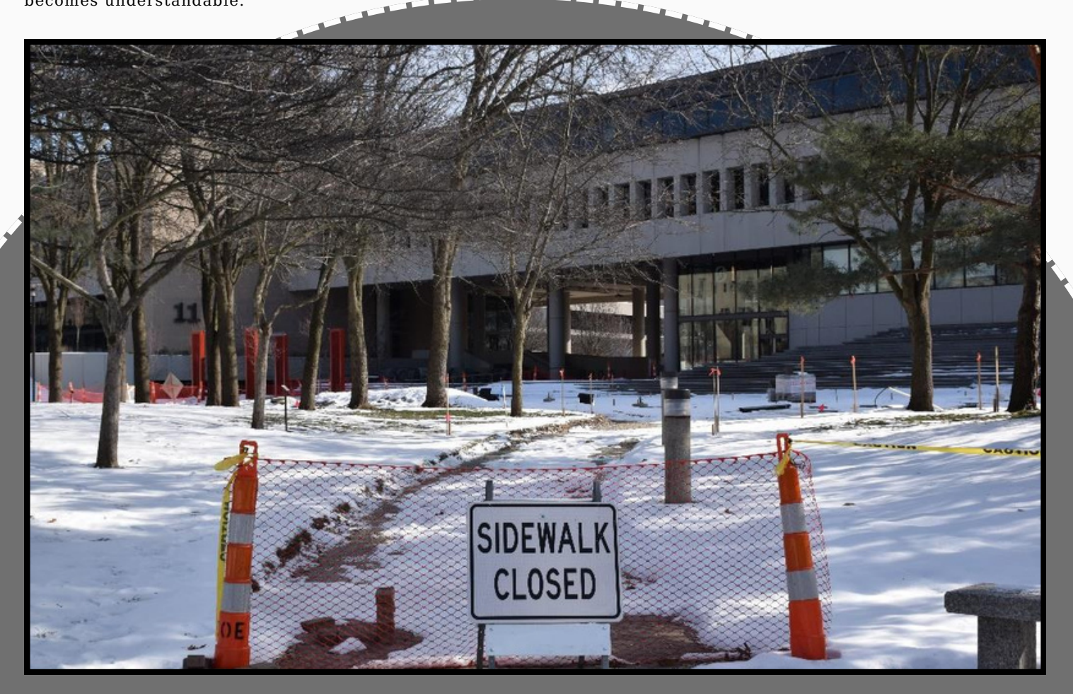
The construction of the sidewalk at Sinclair campus.

The patience of students and faculty is appreciated and the facilities management is committed to completing the project as soon as possible.